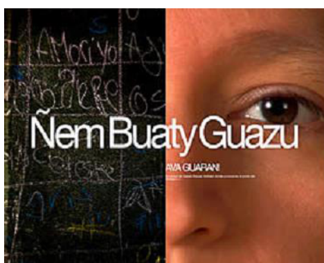
Figure 3. ID Languages

Source: http://www.encuentro.gov.ar/sitios/encuentro/Noticias/ . Capture date: February 2, 2014.