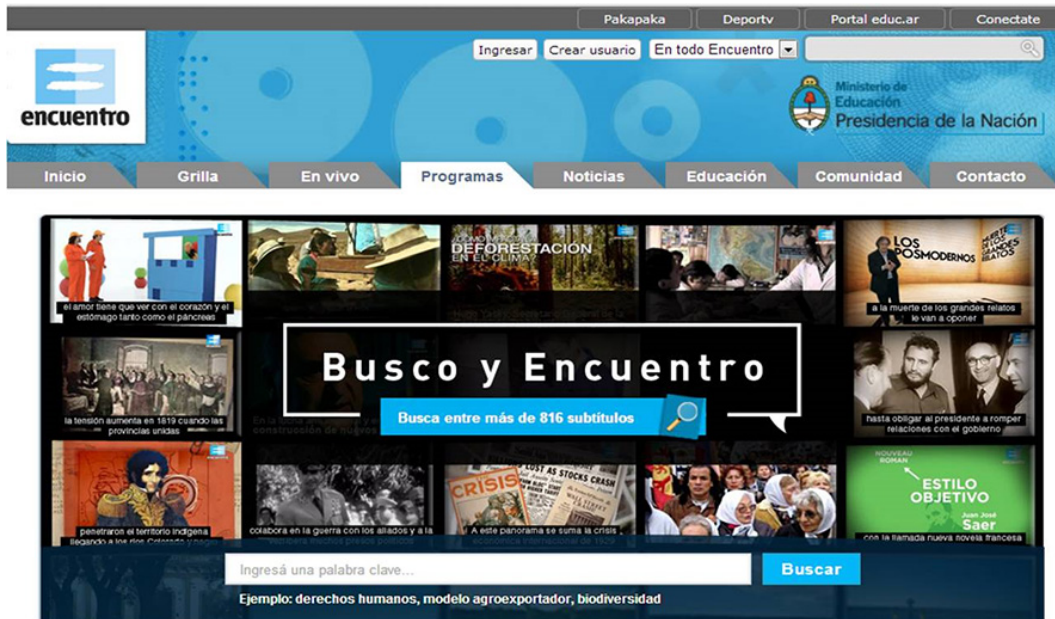
Figura 5. Screenshot of Canal Encuentro's website

Capture date: February 2, 2014.