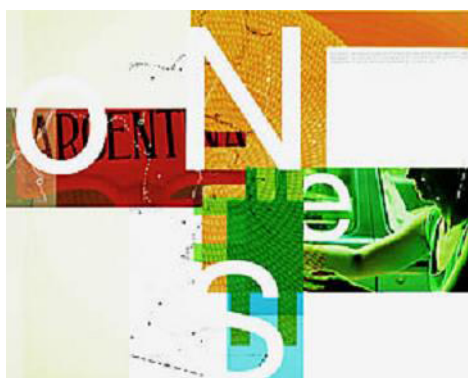
Figure 2. ID People

Source: http://www.encuentro.gov.ar/sitios/encuentro/Noticias/ . Capture date: February 2, 2014.