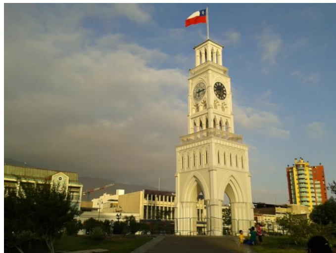
Figure 1. Iquique Clock Tower.

For the analyses through optical microscopy, small wood samples from the clock tower were extracted. For each level three samples were taken at a height of 0.5. The obtained samples were placed in sterile plastic bags and were sent to the Laboratory of Biodeterioration and Biodegradation of Materials (from the Spanish, Laboratorio de Biodeterioro y Biodegradación de Materiales) of the Civil Construction School of Universidad de Valparaíso, where they were stored at 4° C. The samples were prepared by using the techniques previously described by Blanchette & Simpson (1992). The microscopic observation and photographic capture were made through an optical microscope. The microscopic identification was carried out through the use of keys, according to the indications of Díaz Vaz (1979).