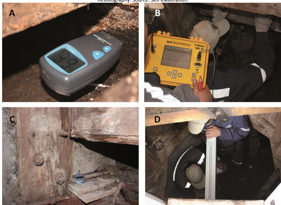
Figure 5. NDT integration in the clock tower: A. Wood hygrometry - B. Ultrasonic wave propagation speed - C. Sensors of temperature and relative humidity - D. Resistography.

The results of visual inspections partially reflect the real condition of a building under evaluation. However, through the NDT integration, it is possible to obtain more accurate and objective information that contributes to a reliable development of the modeling and analysis of this structure. The above is comprised of judgment elements for decision making in the development of intervention projects.