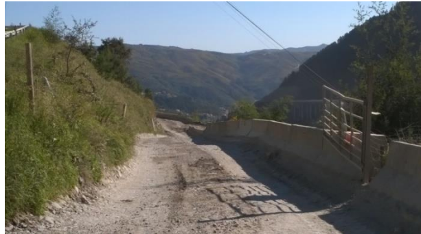
Figure 3. Demarcation of slope border (Source: Lead author).

of the vehicle to the base of the valley. In Marão Tunnel II, the use of a land cord with tapped material from excavation, defended by Gascon (2008), was implemented, to delimit the slope border (so as to minimize the likelihood of approaching the gap), with very positive effects. This was complemented by the use of portable concrete barriers in the most dangerous stretch (Figure 3).