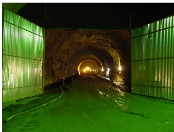
Figure 5. Delimitation gate of final lining area.

One option to minimize air contamination in tunnels (which can also increase the usual problems with lighting in underground works (Velasco et al., 2010), is the installation of curtains. In Marão Tunnel II, in order to separate spaces and minimize risks to the workers in charge of the final coating, the first choice was to install these curtains to contain the contaminated air cloud (and direct it, through crossing galleries, to the parallel gallery). However, this system failed to achieve the desired effect, for two reasons: first, curtains were fragile and easily damaged by repeated opening and closing, and secondly, sometimes curtains were opened before the cloud of fumes from the fire blast crosses that section. To solve this problem, gates were installed, which had a warning indicating the need to keep the curtain closed, shown in Figure 5. All the air quality values measured after that (measures were taken daily) were below the Exposure Limit Values set.