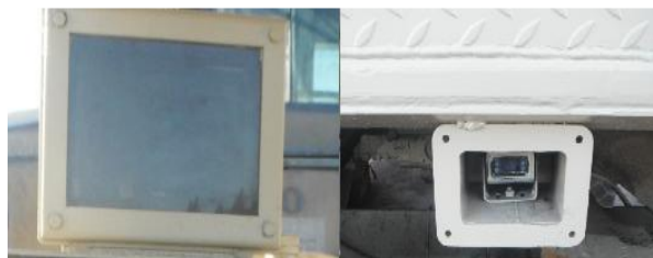
Figure 4. Video camera system

There was the possibility of dirt accumulating on the image collection and viewing systems, so special attention was paid to check that they were conform to the cleanliness requirements.